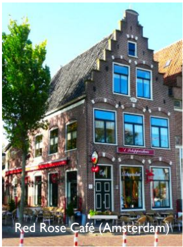
Red Rose Café (Amsterdam)